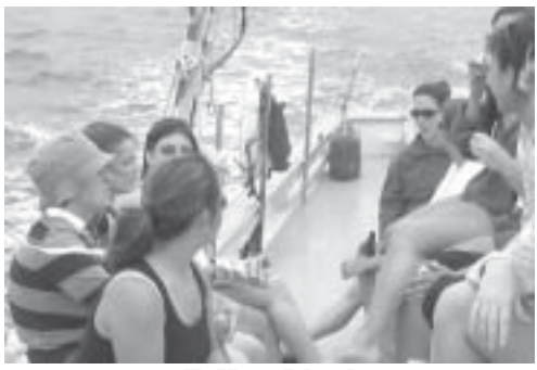
To Horn Island