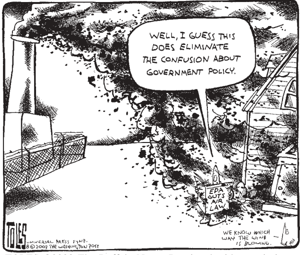
TOLES ©2003 The Buffalo News. Reprinted with permission of UNIVERSAL PRESS SYNDICATE. All rights reserved.

Not by accident. By design. In 2002, sensing a negative reaction to the Administration's environmental initiatives, Republican strategist Frank Luntz – an author of the famed "Contract With America," which, inter alia, targeted environmental laws for amendment and outright repeal – prepared a memorandum for the White House and majority leaders in Congress. Front