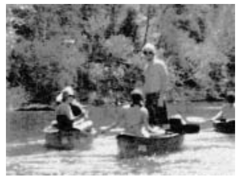
Red Creek - Chalk & Charcoal