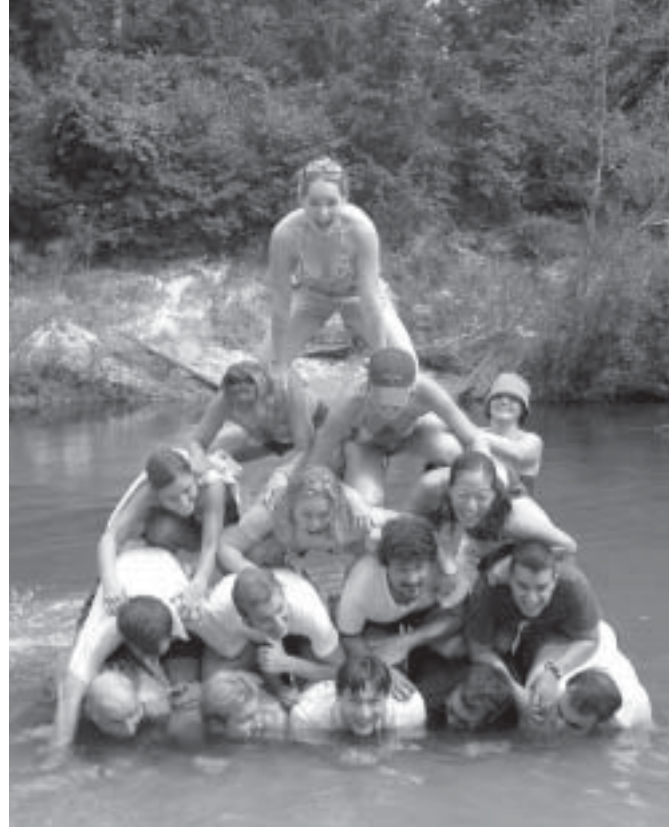
The 5-tier Pyramid

Oct. 25 – Southern Forests: Survival and Sustainability Oct. 28– Conference Planning Nov. 8 – Overnight Canoe Trip (Bogue Chitto Creek) Nov. 11– Conference Planning Nov. 25 – Conference Planning Dec. 3 – Picnic on the Mississippi On-going – Recycling projects