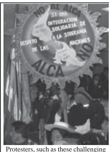
the FTAA, declared victory